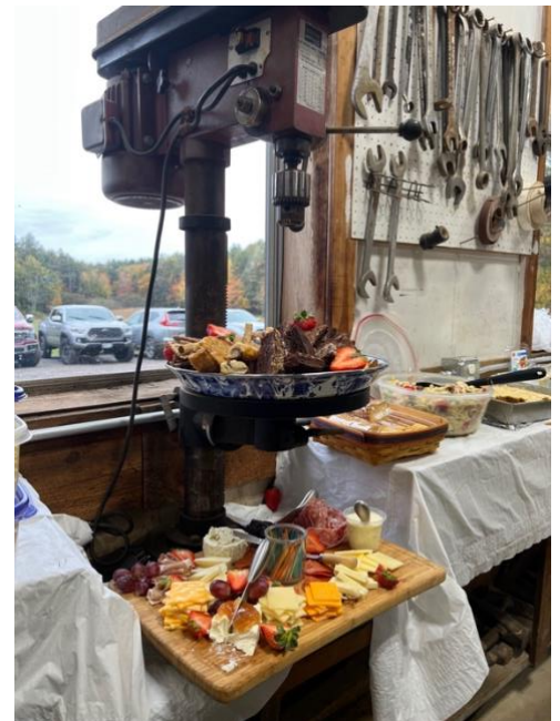
Every space of Dick's barn was utilized, even his drill press