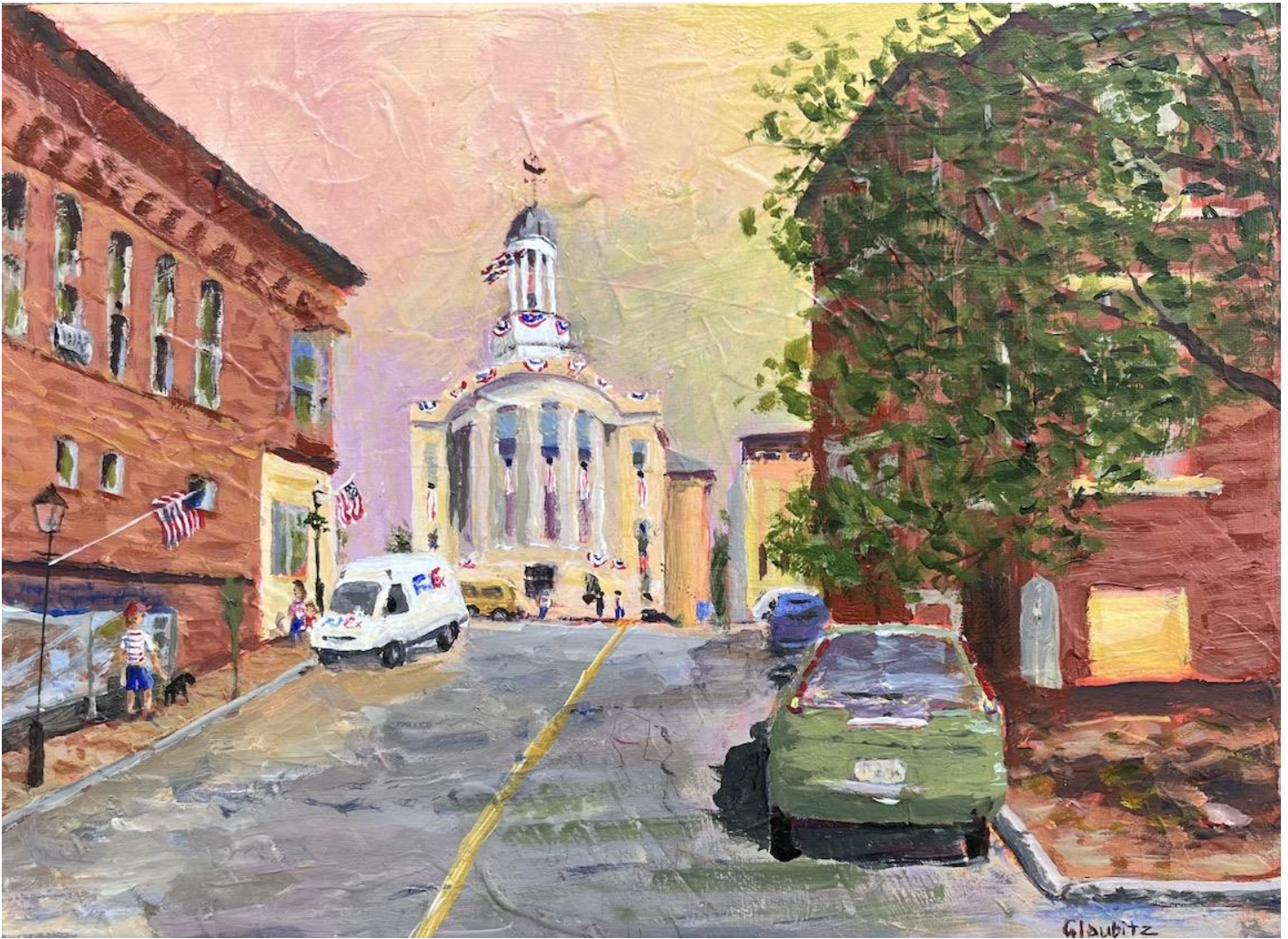
Town Hall, Bath (Acrylic painting by Livy Glaubitz, 12x16.)