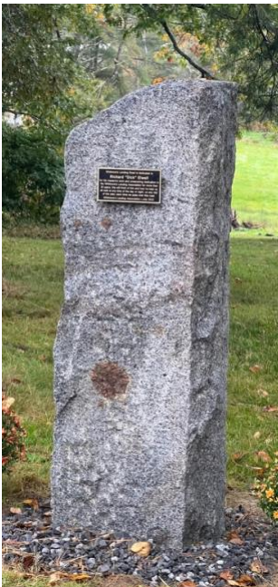
The granite block and bronze plaque erected for Dick on the Elwell property