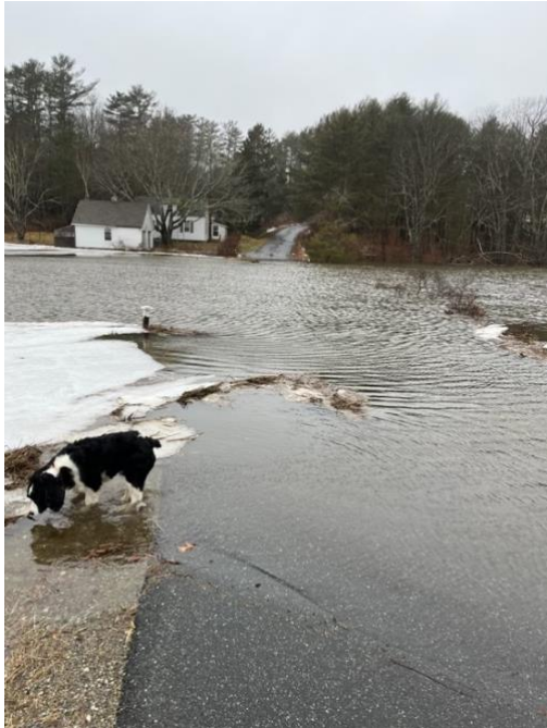
Indian Rest Road at the Packard Property in Flood)

Thanks to a small group of volunteers and a new funding opportunity from the Maine Department of Transportation, Arrowsic will be putting out a Request for Proposals to help find solutions to road flooding on Indian Rest and Spinney Mill roads. The project will conduct hydrologic modeling and geotechnical surveys at both road crossing sites including the flow through the culverts, marshes, and the ‘fish friendly’ culvert between Spinney Creek and Sewall Pond. The