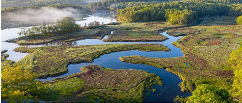
Winding access to the Back River

and guidance from those in attendance, as well as the enthusiasm and visions shared by all for what the Town's new asset can do for the community.