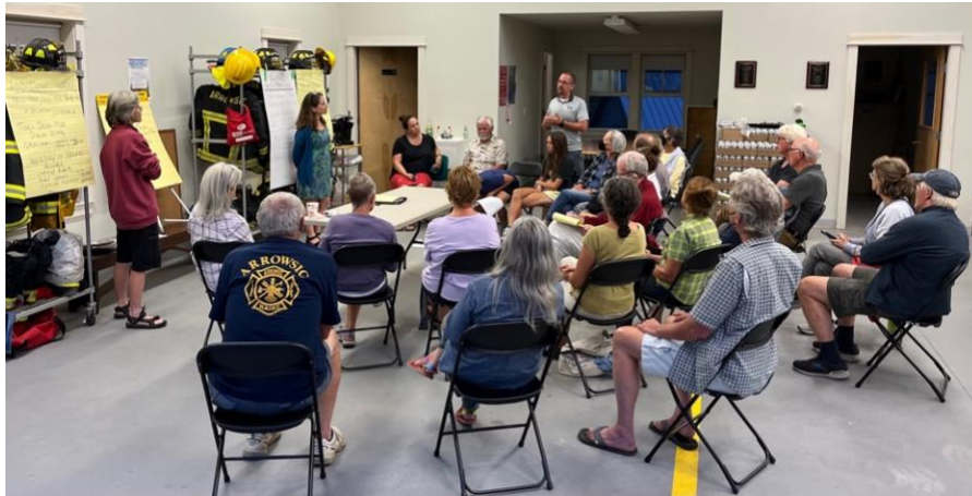
Workshop Participants