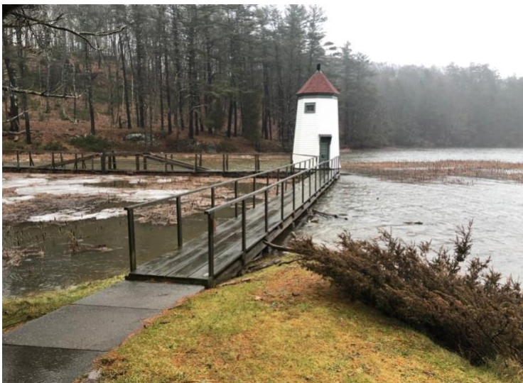
Range Lights