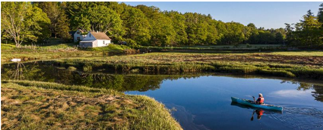
Approaching the Packard House