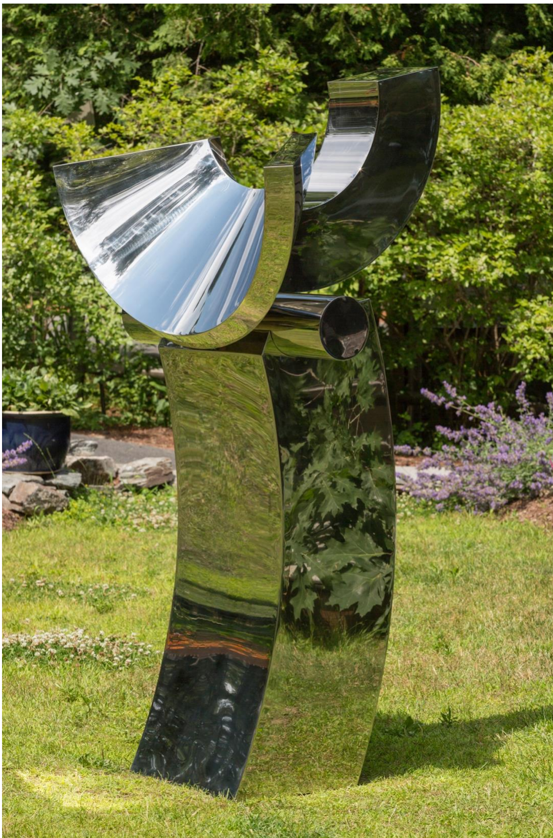
'Aether,' 2017: stainless steel 73" H x 40" w x 31"