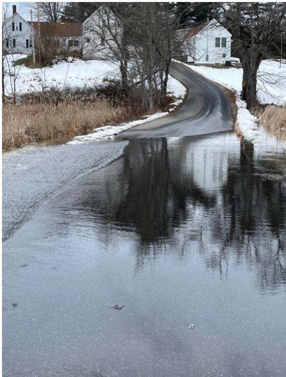
Spinney Mill Road