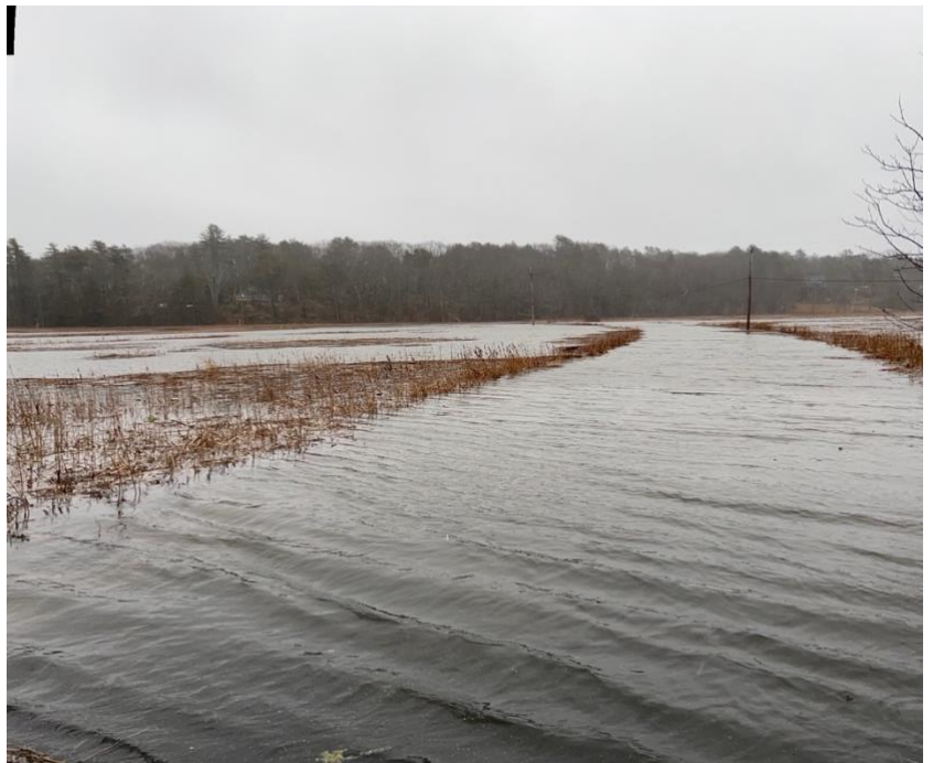
Spinney Mill Road