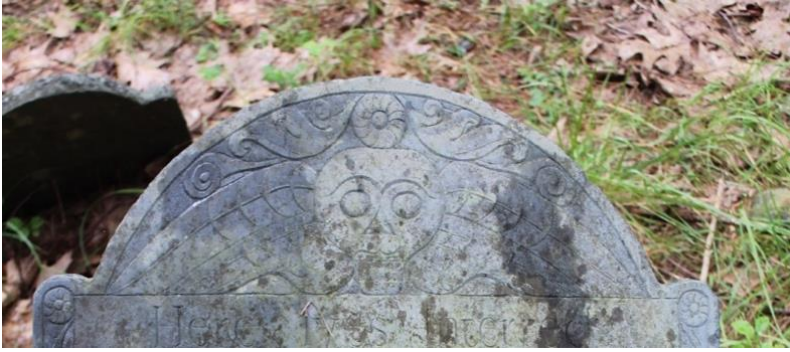
The death's head symbol is found on five of the gravestones in the Preble Cemetery

Several years ago, a Preble descendant organized a group of family members to clean up the Preble