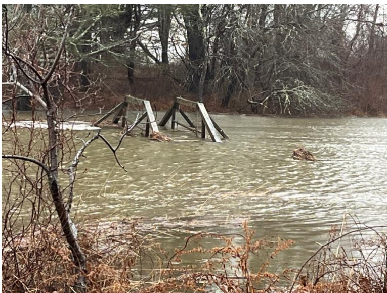
Squirrel Point and Bald Hill Trails