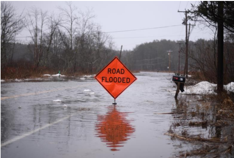
Route 127 at Field Road looking South

As if to emphasize the need for climate resilience discussed elsewhere in this issue, the last year has been the warmest on record, during which Arrowsic has weathered five torrential rainstorms, three of which on December 20th and January 10 th and 13 th set new records. But that was not all. March 10 th saw heavy rains and astronomical high tides that closed Route 127 and adjacent roads for 4-5 hours around midday and again at midnight. Are these an augury of our future in a rapidly warming world?