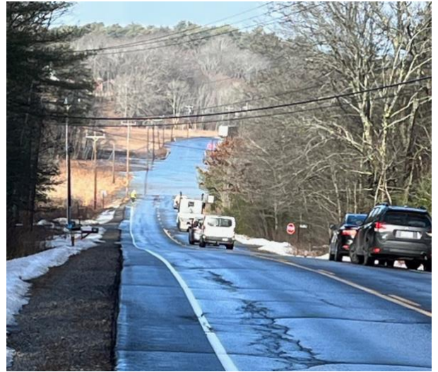
Route 127 at Stone Tree Road and Sasanoa Road facing North