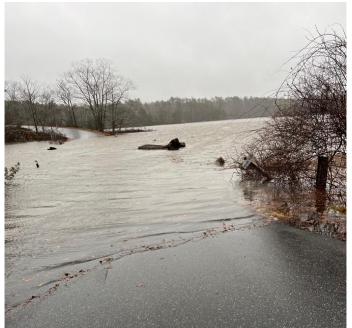
Indian Rest Road