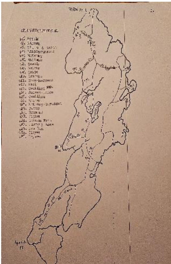
1970s map with cemeteries

After finding the Preble Cemetery for the visitor, I remembered seeing a folder labeled 'Cemeteries' in a