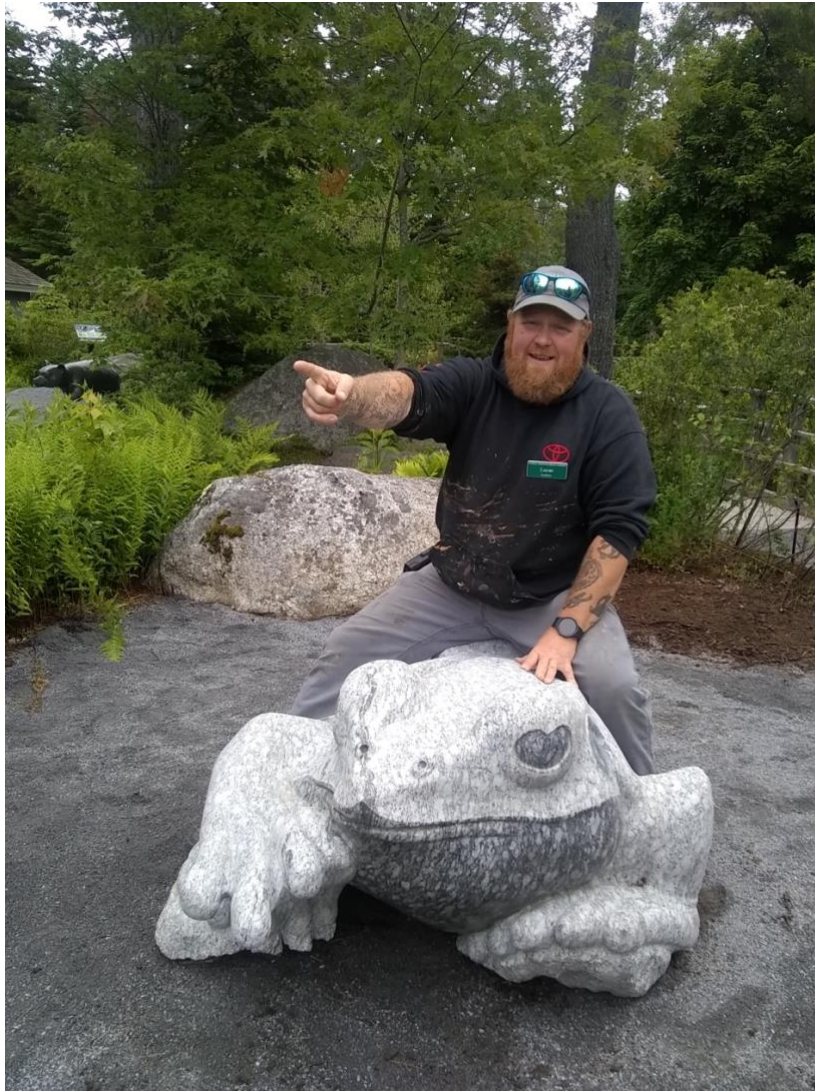
'Frog,' 2023: Diorite 25" H x 43" W x 59" L