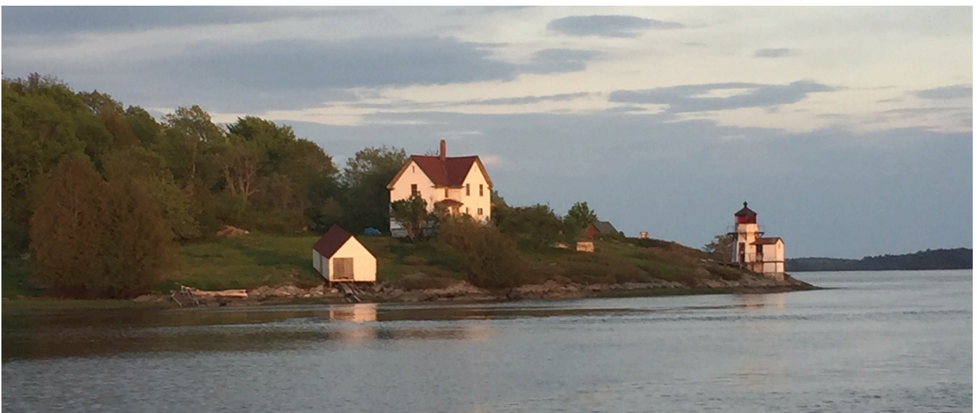
Squirrel Point Light