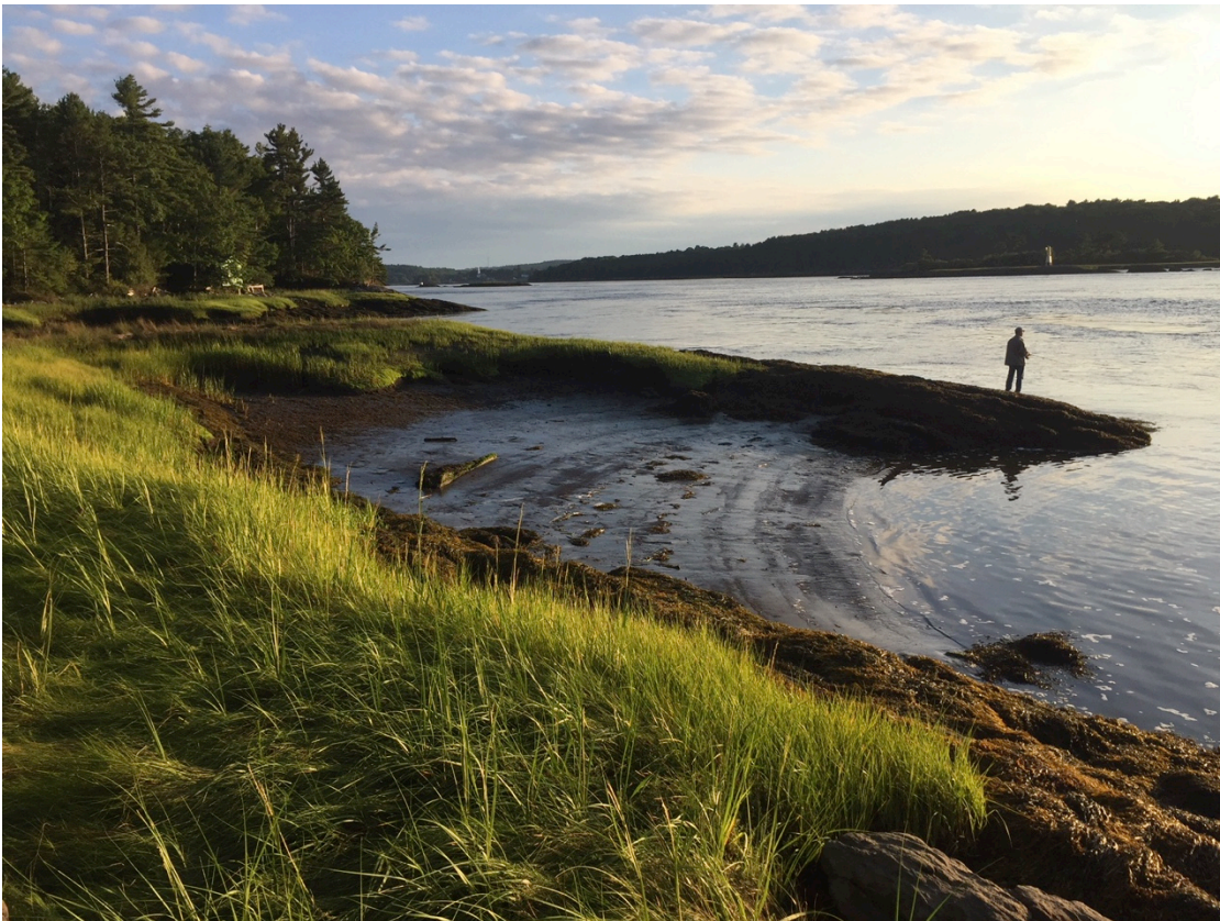
Fishing from the Shore of the Kennebec River