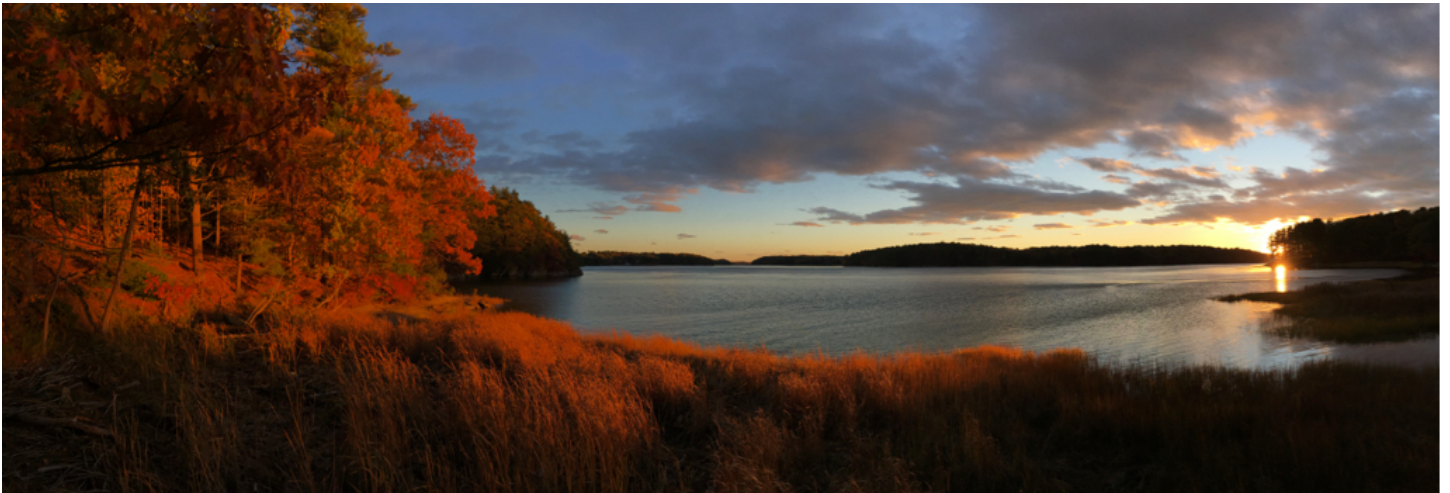
Sunset over the Kennebec River at Fiddler's Reach