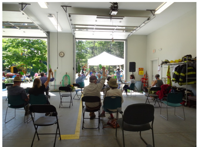
Townpeople Sat Inside and Out at the recent town meeting