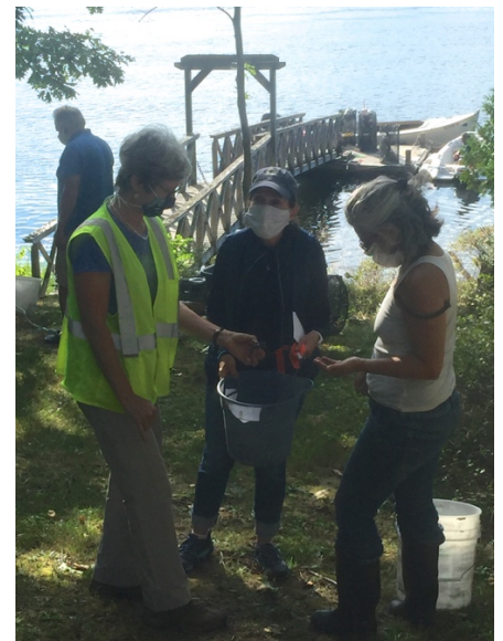
Green Crab Survey in times of the Corona pandemic, physical distancing for the most part, masks, no party and entirely outdoors!