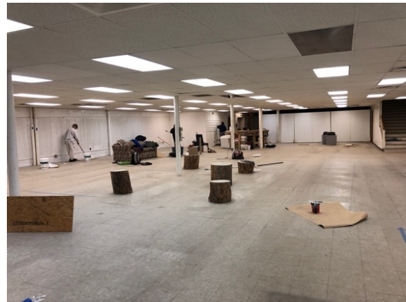
"Not Quite Done Yet!"