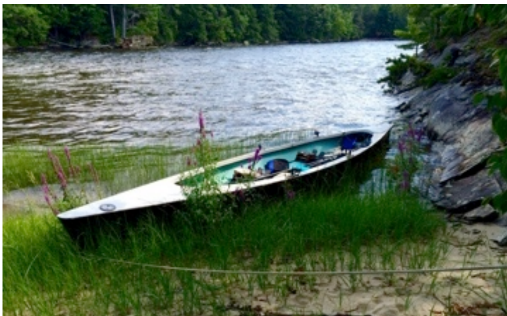
Ockham's Razor, our sliding seat four-with-cox gig at Sturgeon Island

Once the boat is launched, we take our assigned seats and leave the dock. The tide usually dictates which course we take. We try to do the hard part first and come back with the tide. If you live near the western shore of Arrowsic you may have seen us out there. Sometimes it seems that we are the only ones on the water. The Kennebec can be challenging and the conditions are different almost every time. It can feel like flat water rowing on a lake. At other times we hit 1-2 ft. waves, white caps, cross winds and strong currents. We use eddies to our advantage and try to stay out of standing waves. The boat's performance, lateral stability and buoyancy are amazing. We had fun doing a self-rescue drill once on a warm day on Damariscotta Lake. The gig floats even when it is full of water and is still 'rowable'.