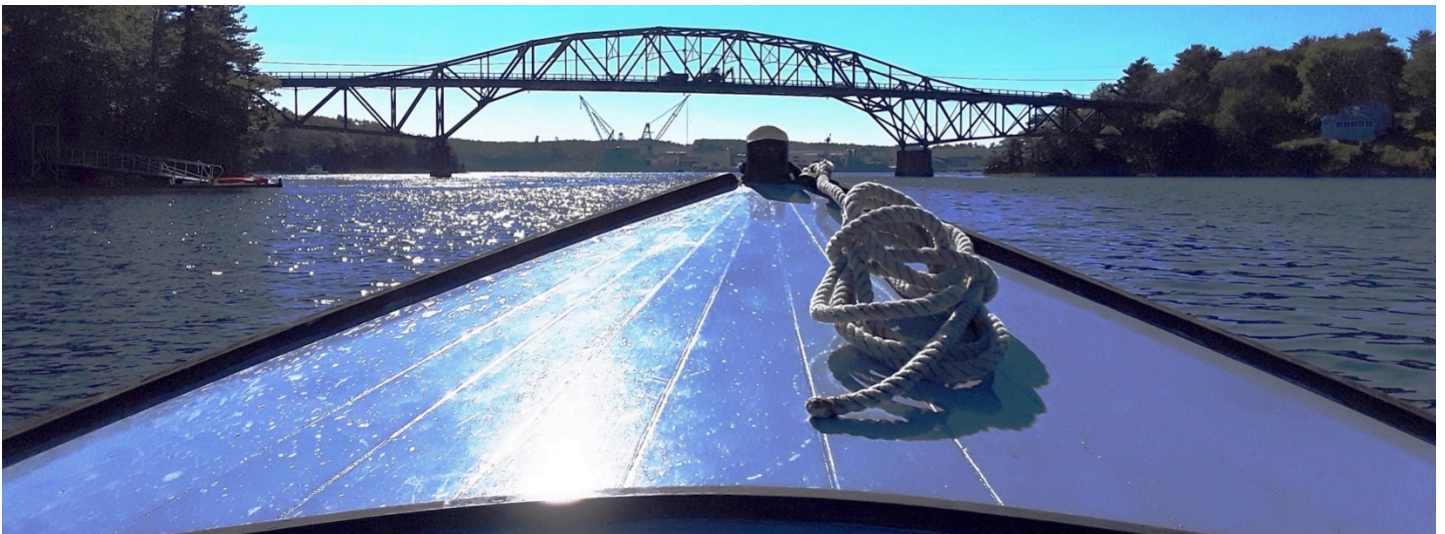
Approaching the Arrowsic Bridge