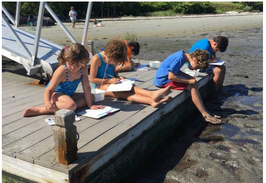
Watercolor painting at Clam Camp

This year, the Shellfish Conservation Committee did not do either of its usual surveys of green crabs (in the rivers) or clams (in the mud). We will resume these fun activities next summer—along with some other possible projects. Anyone is welcome to join our meetings, which are scheduled to be held at 6 pm at the Town Hall on Dec 11, 2018; and March 12, May 14 and September 10 in 2019. If you are interested in joining in or want clam-related information, please write to clams@arrowsic.org .