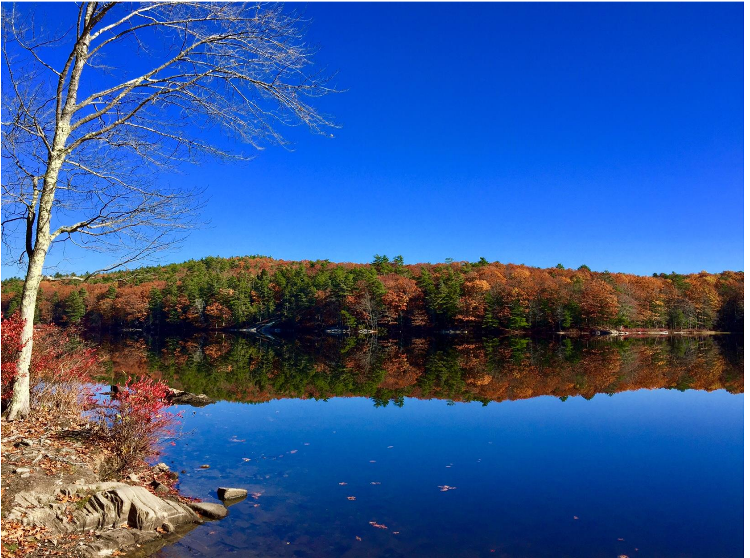
Sewall Pond in all its autumn splendor. The Arrow welcomes your favorite photographs of all things Arrowsic.