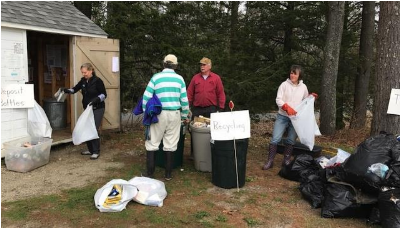
Members of the Annual Roadside Cleanup crew separating recyclable materials from everything collected. The Conservation Commission and Recycling/Solid Waste Committee thank the more than 30 intrepid volunteers for their participation.