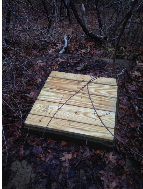
Kevin Kauffunger and Steven Paul built a cap for an old open cistern between Squirrel Point and the northern clamming flat that presented a hazard. Photos show before and after.