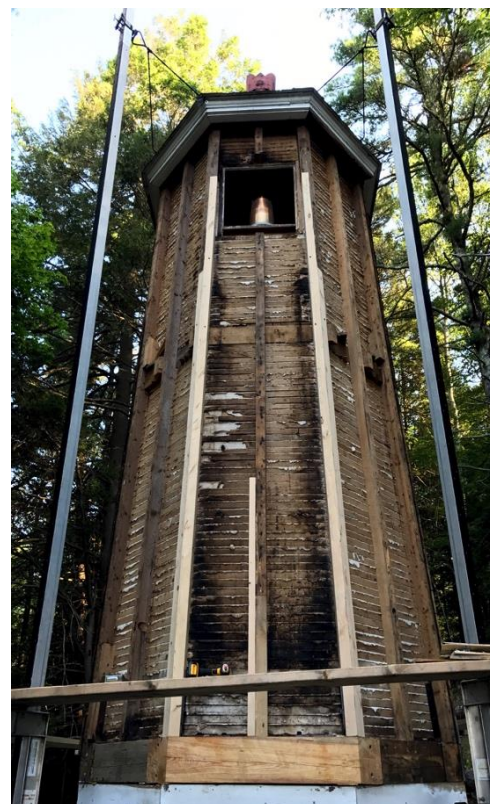
Restored sills and posts in place at the rear tower support the structure.