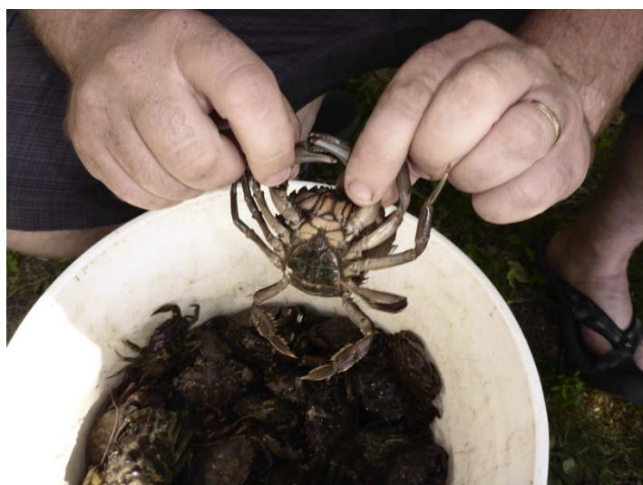
(l) Hauling the traps after an eight-hour soak and (r) A female green crab.