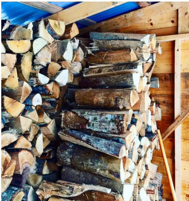
Winter Is Coming