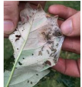
Immature browntail moth larvae in webbing on the underside of a leaf.

This insect seems to be spreading to more and more locations in Arrowsic. The detection of hemlock woolly adelgid (HWA) in three counties of southwest Nova Scotia this month is an important reminder that this hard-to-detect insect could be, undetected, in forests of interior and Downeast coastal Maine. To date, any HWA found east of Camden has been thought to be associated with artificial spread, and populations have not been found in forest trees in that area. However, it is worth taking a regular look at hemlocks outside the known infested area in Maine (map below) for the telltale white, wispy material covering adelgid on the twigs of hemlock trees.