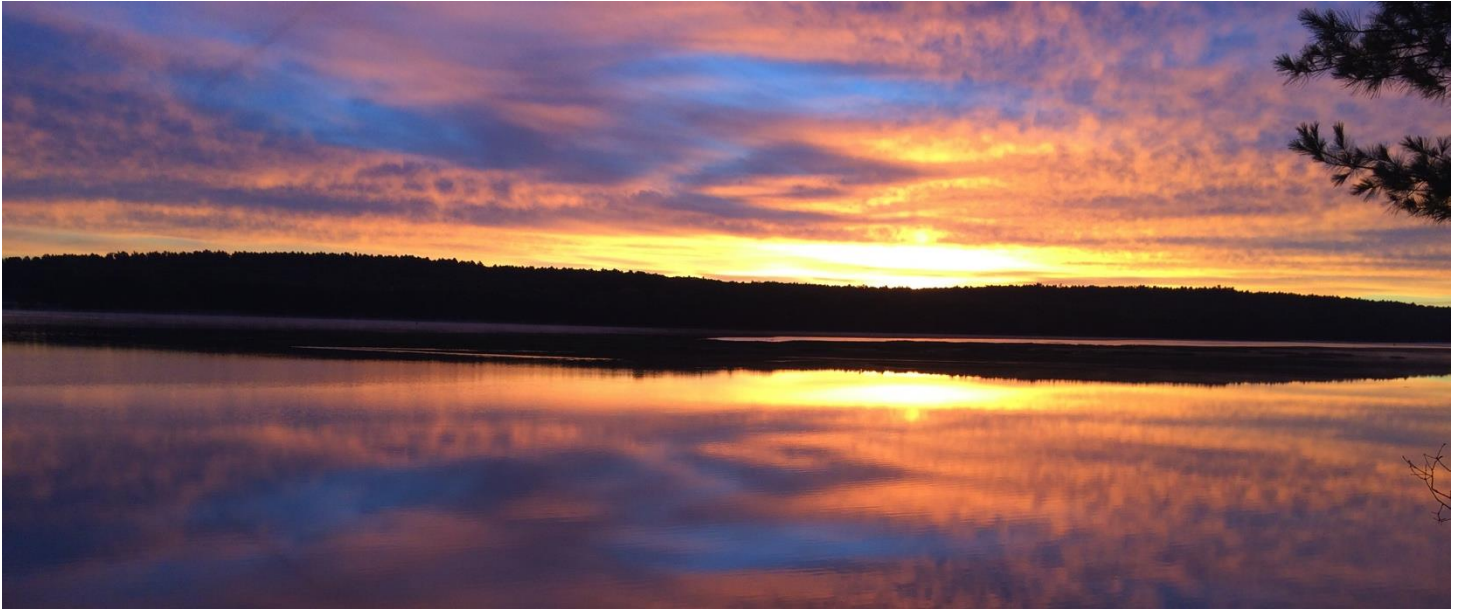
Sunrise over the Sasanoa