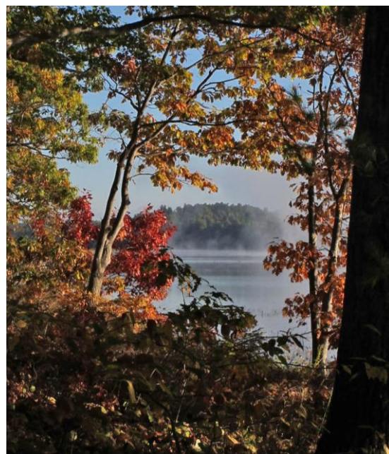
Season of Mists

(Click on each photo for a full-size version.)