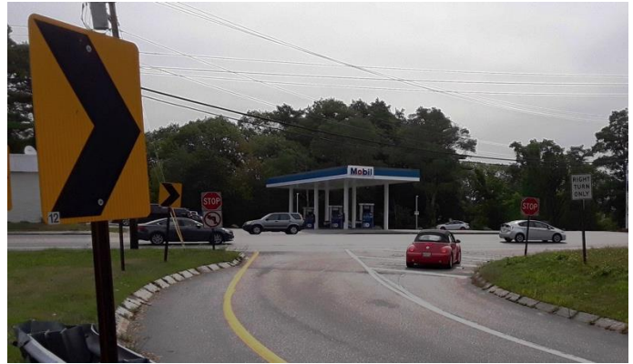
(l) Perfect position—just what MDOT ordered: Car pulled up straight ahead, right up to the stop sign, and ready to turn right. (r) Car is turning entirely from the off-limits area. Cars should not be going over the solid white lines, hatched lines, or speed bumps. MDOT says this area is reserved for large vehicles like tractor-trailers.