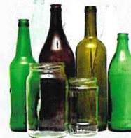
Glass Bottles & Jars (Empty food & beverage bottles & jars)