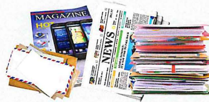
Junk Mail, Periodicals, & Office Paper (Envelopes, catalogs, & soft cover books)