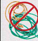
TANGLERS DON'T BELONG