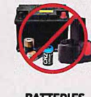
BATTERIES OF ANY KIND DON'T BELONG