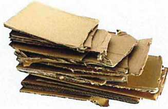
Corrugated Cardboard (Wavy center layer)