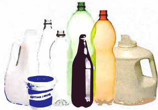
Plastic Bottles, Jugs, Tubs, & Lids (Empty kitchen, laundry, & bath containers)