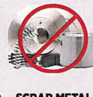
SCRAP METAL ITEMS DON'T BELONG