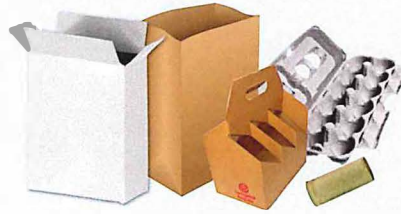
Boxboard (Dry-food boxes, paper bags, egg cartons, & rolls)