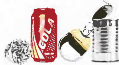
Aluminum & Steel Cans (Empty cans, bottles, & foil)