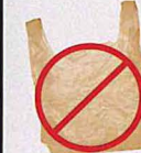
PLASTIC BAGS DON'T BELONG

THE ITEMS LISTED BELOW DON'T BELONG IN YOUR RECYCLING BIN.