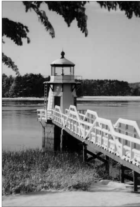
The Doubling Point Light in wintertime.

This past summer at Doubling Point Light, we retained the services of the Kennebec River Paint Company, Benjamin Day and Aiden Coffin, to repaint and stain the walkway and bell tower. Come visit the Lighthouse to enjoy the beautiful job they have done!