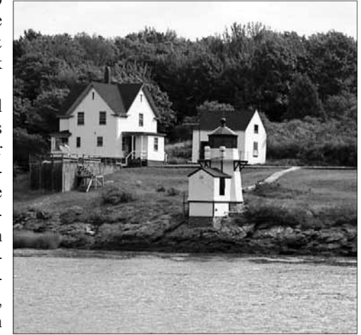
Squirrel Point Light