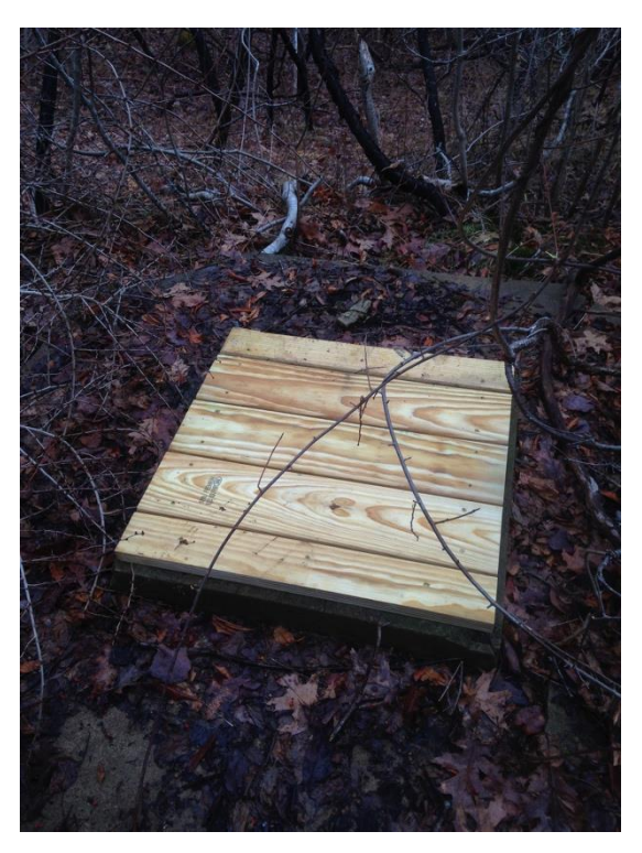
Kevin Kauffunger and Steven Paul built a cap for an old open cistern between Squirrel Point and the northern clamming flat that presented a hazard. Photos show before and after.