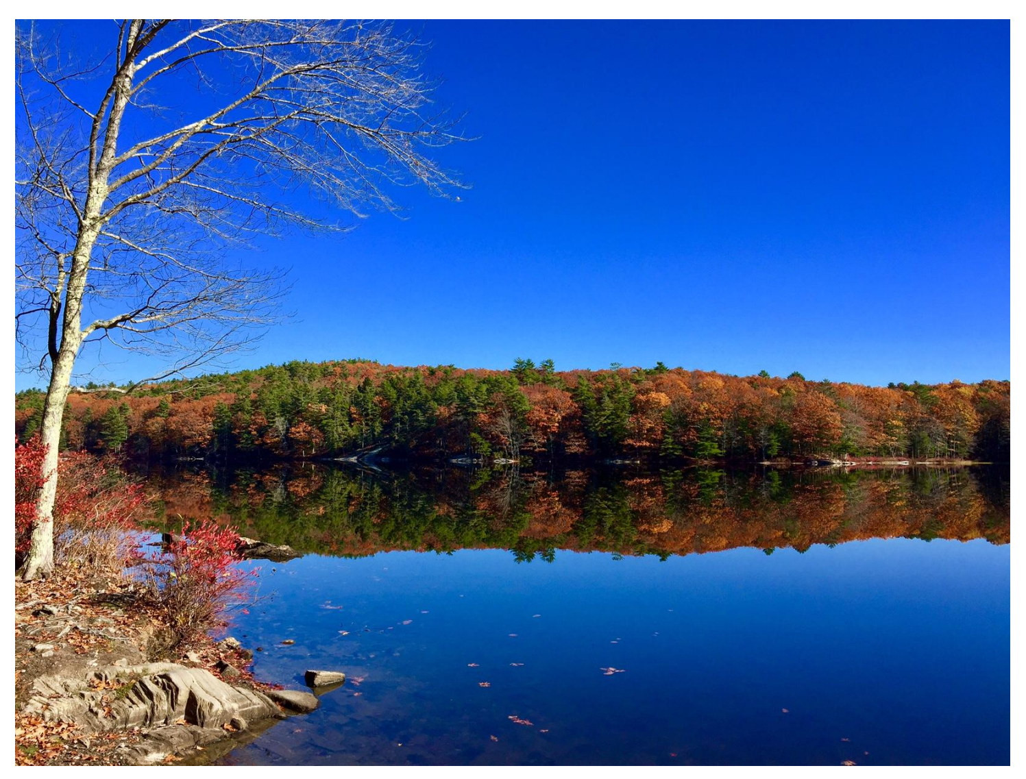
Sewall Pond in all its autumn splendor. The Arrow welcomes your favorite photographs of all things Arrowsic.