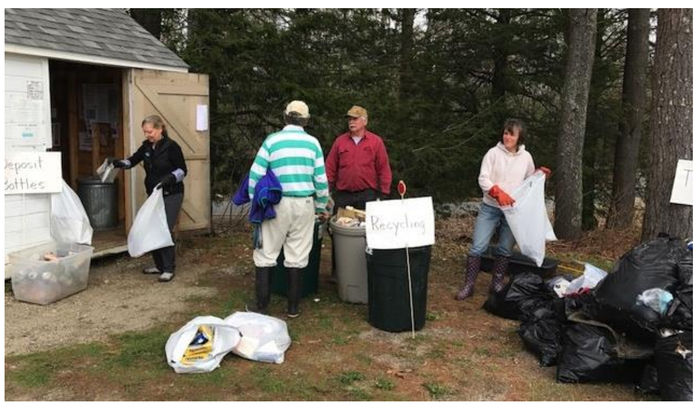
Members of the Annual Roadside Cleanup crew separating recyclable materials from everything collected. The Conservation Commission and Recycling/Solid Waste Committee thank the more than 30 intrepid volunteers for their participation.